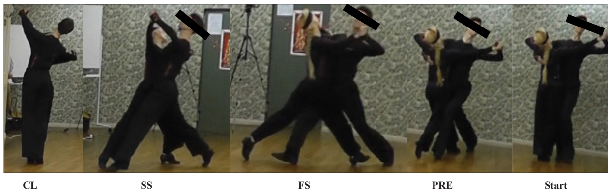
Figure 1. Descriptions of the male and female waltz movements, respectively

Notes. PRE – preparation step; FS – first step; SS – second step; CL – closing legs.